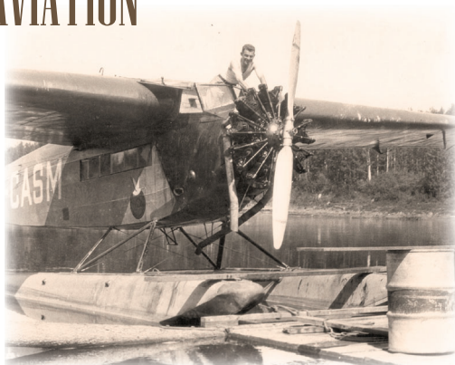
Pilot C.H. "PUNCH" DICKINS stands in the cockpit of Fokker Super Universal G-CASM while moored at a dock on the Snye River in Fort McMurray, Alberta, c. 1929.